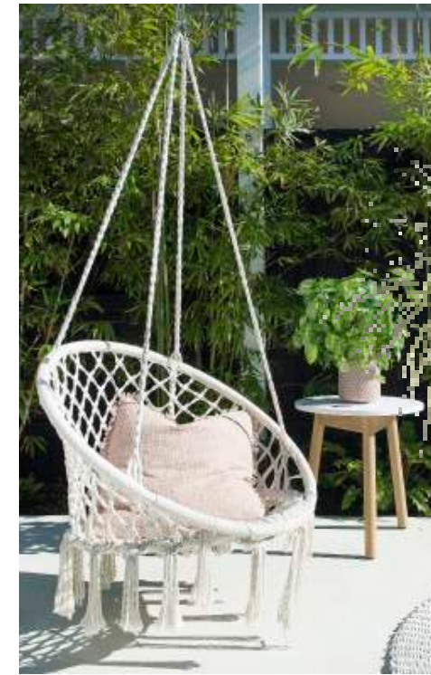
Marimekko 'Veljekset' cushion cover $39.50 finnishdesignshop.com