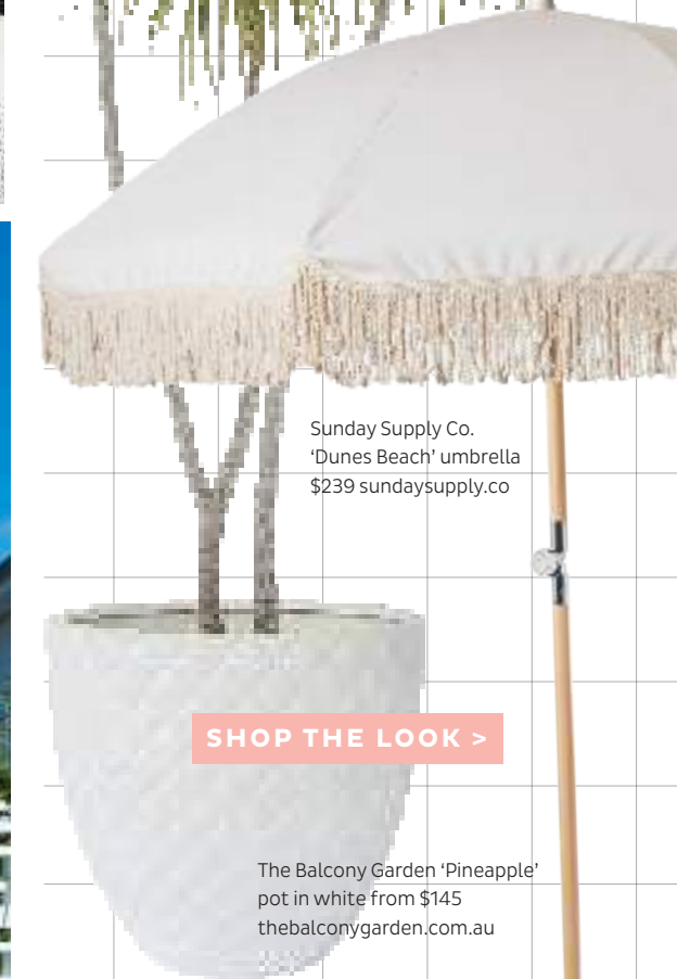
Sunday Supply Co. 'Dunes Beach' umbrella $239 sundaysupply.co

See more of this outdoor space, plus lots more garden and plant inspiration in the new issue of Planted Magazine.